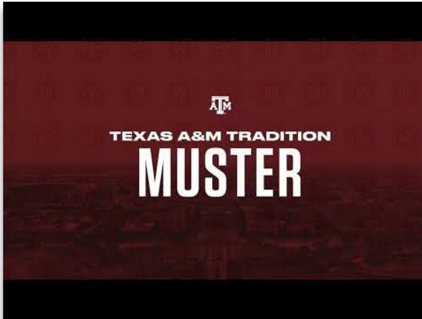
Fig 4. Aggie Muster | Texas A&M Traditions. Texas A&M University. (2022)