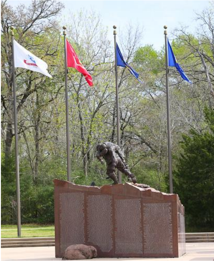
Fig 3. Louis L. Adam Memorial Plaza & Wall of Honor, Brazos Valley Veterans Memorial. City of College Station.